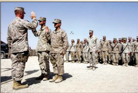
MARINES RENEW THEIR COMMITMENT TO INTEGRITY AND HONOR